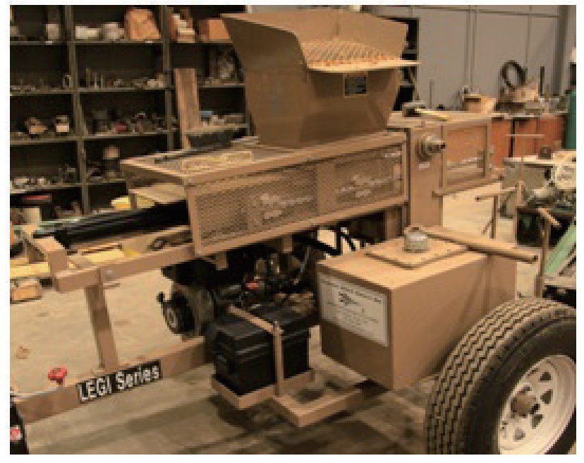
Figure 2. A semi-mechanized portable machine

The block is created by compressing the soil-cement combination in the press chamber. When a force is applied, the soil-cement mixture is compressed, which lowers the fraction of voids and raises the material's density. The higher the density may be increased, the less porous the soil will become. The amount of moisture must fall within a specified range and not be too high (Prasad, 2020).