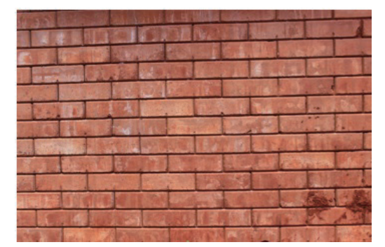
Figure 6. Masonry wall using compressed stabilized earth blocks

Bonding is the method used to arrange blocks in a wall. The careful arrangement of all the joints to ensure the proper transmission of vertical loads is a necessary condition for proper bonding. In other words, alternate courses are planned out in a way that prevents vertical seams or joints between one course and the one below from lining up (Figure 6).