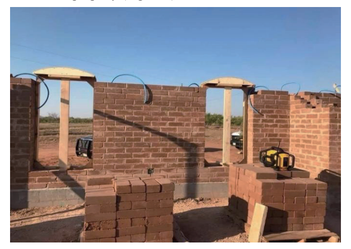
Figure 7. Construction of masonry wall using compressed stabilized earth blocks

The combined strength of the mortar and the blocks determines how strong a wall will be. It is possible to produce blocks with strength of 30 to 60 kg/cm<sup>2</sup>. In a wall subject to vertical pressures, blocks and mortar of similar strength will support the pressure in an equal manner; but, if there is any weakness in the mortar, the blocks will be susceptible to shearing stress, which invariably leads to cracks and fissures. Using low-strength blocks with high-quality mortars or high-strength blocks with weak mortars is a mistake since, in the latter case, the failure will be in the blocks rather than the mortar, in contrast to what happens in the former. In the construction of a soil-cement wall, water absorption by the blocks from the new mortar must be taken into consideration. It is advised to moisten the surface of the blocks in touch with the mortar to ensure there is enough water for the mortar to set properly (Figure 7).