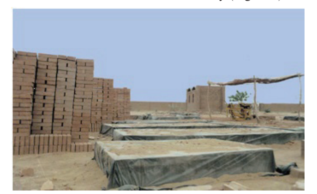
Figure 5. Stacking curing and protection of earth stabilized blocks

As soon as you can, place the blocks in a shady area with protection from the sun and rain on a level, absorbent surface. Place each block on its edge and leave enough room between them so that they do not touch. The blocks must be allowed to dry gradually without experiencing any abrupt temperature changes. Therefore, the first twenty-four hours after they are made require strict moisture control to prevent them from drying out completely all at once, this could degrade the material's quality. Blocks must be thoroughly sprayed three times per day with the fine water spray for 15 days after 24 hours of de-molding. Blocks must be properly sprayed three times per day with the fine water spray for 15 days after 24 hours of de-molding. The strength of the block will increase as it dries more slowly (Figure 5).