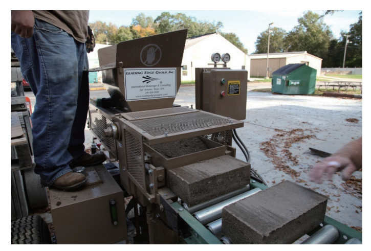
Figure 3. An automatic compressed earth blocks making machine

The process of manufacture of soil-cement blocks involves the following five steps (Adhlakha, 2019):