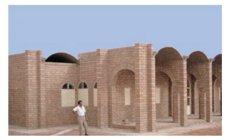
Figure 8. An institutional building made from compressed earth blocks in New Delhi, India

In general, soil cement can endure some shocks or strains brought on by seismic events. Tensile stresses that cannot be absorbed by the soil-cement material may develop in areas that are prone to very strong seismic disturbances; it is therefore desirable to provide vertical reinforcement to absorb stresses of this nature. At wall connections, enough vertical reinforcement is offered in accordance with IS: 4326. In seismic areas, it's crucial to construct walls with a continuous beam or band that adds rigidity and supports the stability of the home. According to IS 4326, a lintel band is also laid. Figure 8 shows an institutional building made from compressed earth blocks in New Delhi, India.