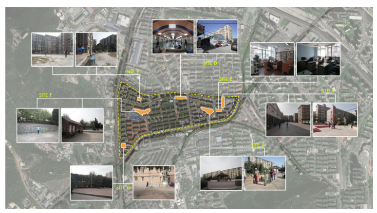
Figure 1. Distribution of public event venues

In this research area, there are 5 centralized activity venues, several decentralized activity venues, 1 cultural and sports venues, and 1 community activity center.