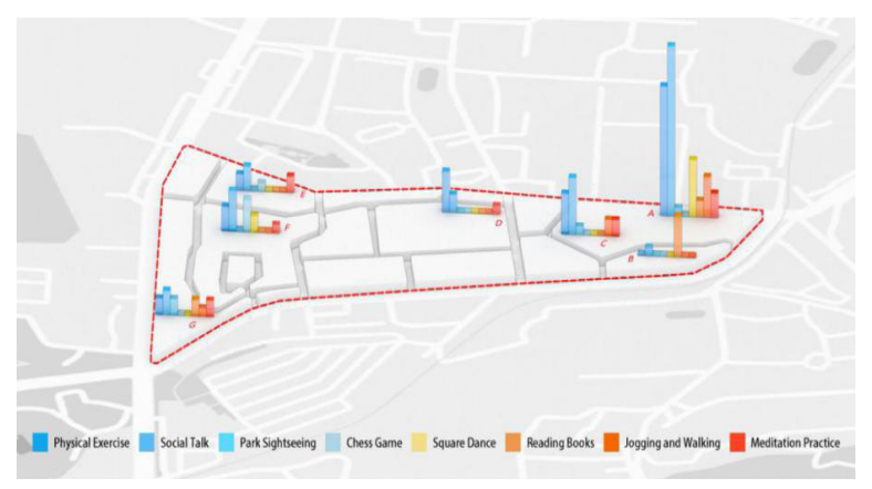
Figure 2. Distribution of outdoor activity types of people in different plots

At the event site, the centralized event venue is the choice of most people, and the scattered event venue is the choice of 66-80 years old, especially the 80-90 years old. The reading room of the community activity center is mainly elderly people on weekdays. <sup>[3]</sup> Children will take a half-day vacation on Wednesday afternoon to learn and read. In activity facilities, fitness equipment facilities are used more frequently, especially among the elderly. Slides and swing facilities are most popular with children.