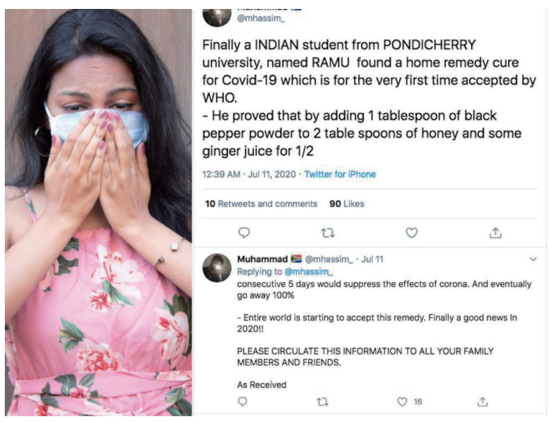
Figure 1: A fake remedy to COVID

The digital age and the prevalence of social media have accelerated the speed at which information. The instantaneous sharing of information across platforms allows even false or unverified information to reach large audiences rapidly. This swift spread can lead to the amplification of misinformation and can be particularly detrimental during public health crises (Bago et al., 2019).