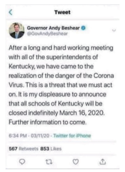
Figure 2: A fake post claiming all schools should be closed in Kentucky

The decentralized and largely unregulated nature of the internet and social media platforms presents a significant challenge in combatting the infodemic. Unlike traditional media outlets, there is no central authority responsible for fact-checking or verifying information shared on the internet. This lack of oversight makes it difficult to control the dissemination of misinformation, contributing to the infodemic's persistence (Barcelos et al., 2021).