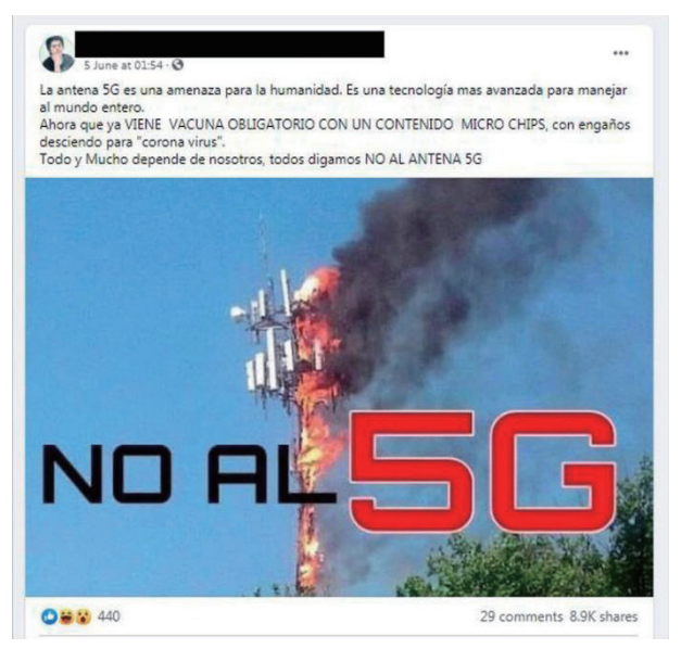
Figure 3: A Facebook Photo claiming that 5G technology is causing Infectious Diseases 2019

interactions. When users engage with false or misleading information by liking, commenting, or reposting, algorithms may promote similar content, creating an echo chamber effect[5]. This replication of misinformation within user networks can reinforce false and make it challenging to correct them.