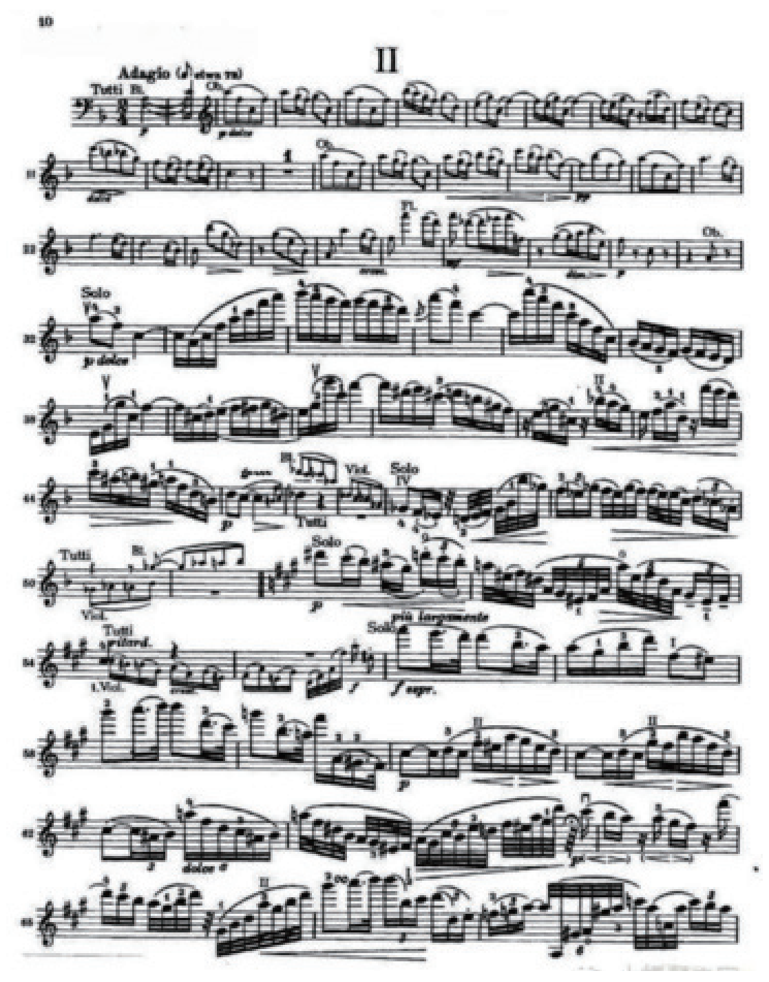
Figure 2. The second part

The second part, the soft adagio, is like a middle-aged man looking through the world of mortals looking for memories in the music.