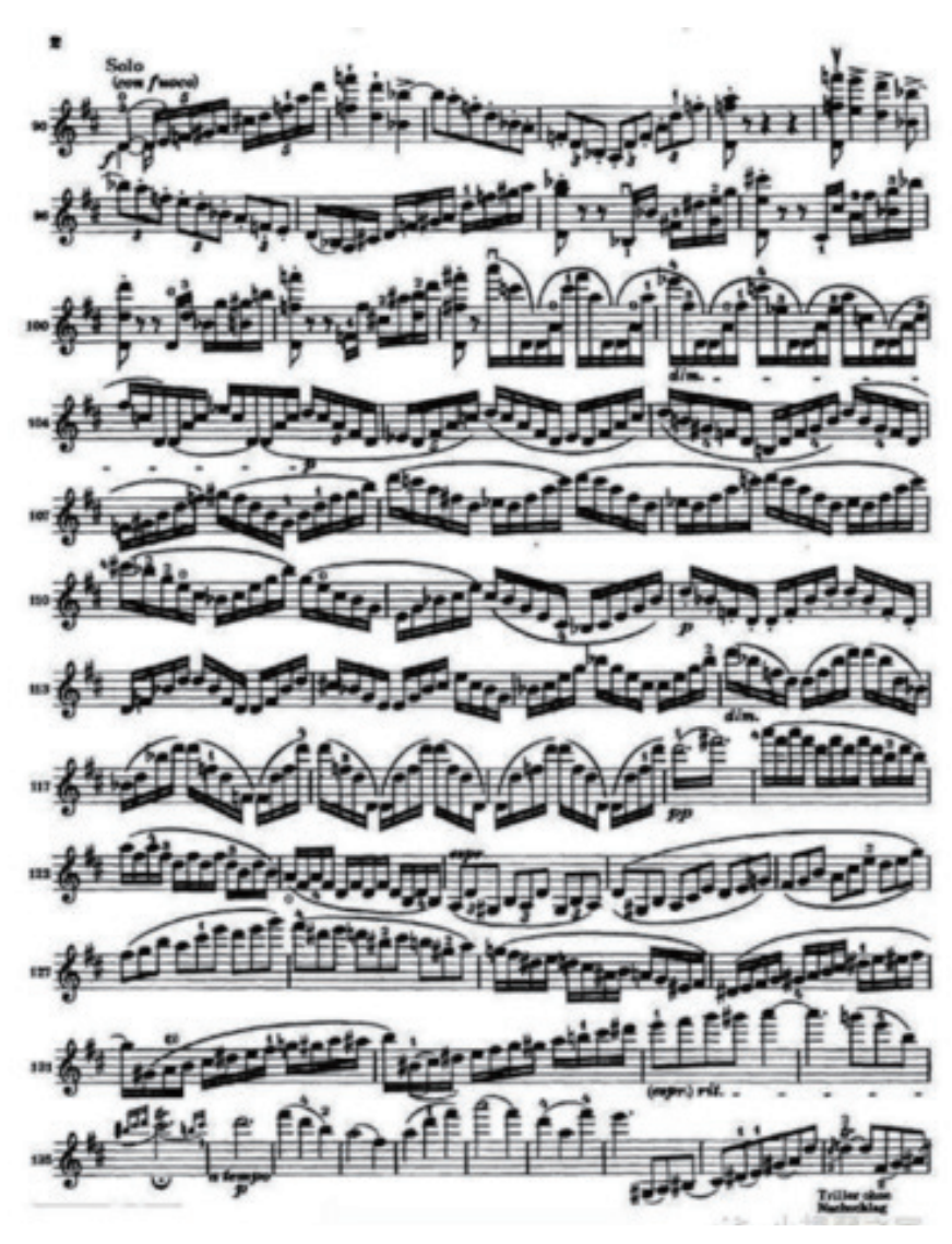
Figure 1. The first part

Brahms's Violin Concerto in D Major is divided into three movements. The first part, the mediocre allegro, with a stormy beginning, has the momentum of Beethoven's works.