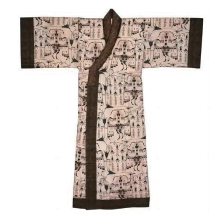
Figure 4. Phoenix bird flower patterns embroidered with light yellow silk robe

If the character pattern is a change from natural form to decorative pattern, then the character pattern is a change from story illustration to decorative pattern. Compared with the symmetrical layout of the characters in the early pattern pattern, the Qing Dynasty gradually transitioned into painting composition. The character story round pattern, with the painting of the traditional cognition of the round flower pattern, with the needle, with the line for color, each basic composition unit is an illustration. This is the innovation of the clothing pattern, but also the expansion of the illustration carrier. The harmonious beauty of the character round nest pattern lies in the two aspects of shape and color. From the modeling point of view, the character image is abstract and vivid, it seems to deliberately imitate the natural form of people draw, and the posture of the tree stone fit. Far look at the characters in the nest and the whole nest integration, close look is a clear picture. From the color point of view, the color matching of the whole jacket and a single nest look to form small color blocks, forming a beautiful picture bottom relationship.