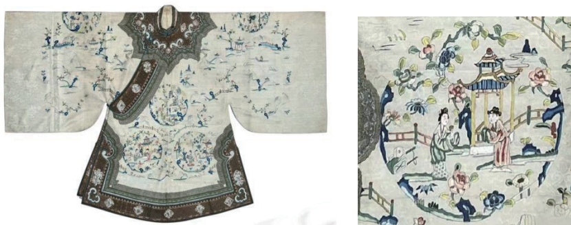
Figure 5. White satin embroidered west chamber story dress

In the Ming and Qing Dynasties, the Romance of the Western Chamber was widely circulated in the society. In the "Wonderful full phase annotation Western Chamber" said: "In the alley, the family descendants recite". At the same time, the 24 filial piety maps were gradually finalized as the "24 filial piety maps" spread by later generations. In this period, filial piety maps were widely used. In addition to sarcophagus, tombstones, utensils, wood carved door fans, they were also commonly included in books in the form of illustrations and appeared in clothing. This white satin embroidered story of the West Chamber of the Qing Dynasty (Figure 5), all of the ten nests are illustrated by the story of the West Chamber, which is surrounded by lake rocks, Bridges, pavilions, willows and other places. Purple satin colorful embroidery (Figure 6), twelve rounds pattern is the story of 24 filial piety, around butterflies, cranes, ball flowers and other auspicious patterns. To some extent, the story plot appeared in the nest pattern of the Qing Dynasty, carrying the dual significance of decoration and cultural prosperity.