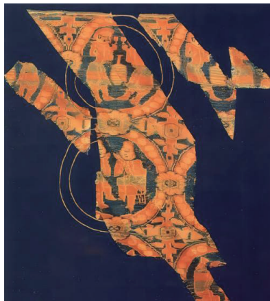
Figure 2. The dragon pattern jade ring

Thus it can be seen that the characters at this time, in the form of the characters with graphic nature symmetry, and few props, no background, and did not get rid of the composition characteristics of the pattern. From the point of view of the content of the nest, the pattern is the result of decorative patterns into life scenes, and is mostly influenced by the spread of culture and ideas.