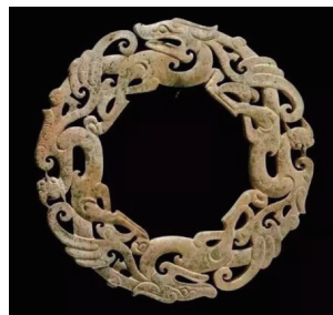
Figure 1. The dragon pattern jade ring