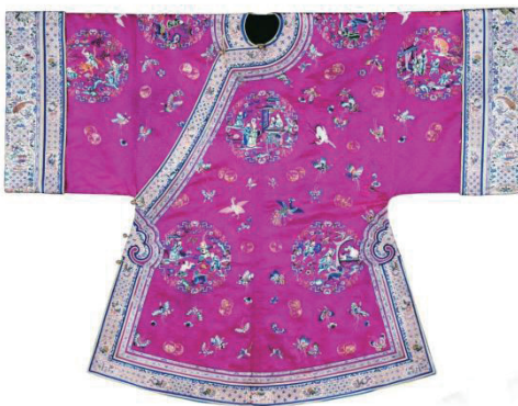
Figure 6. Purple satin multicolored embroidered twelve figure round patterns of women's gowns