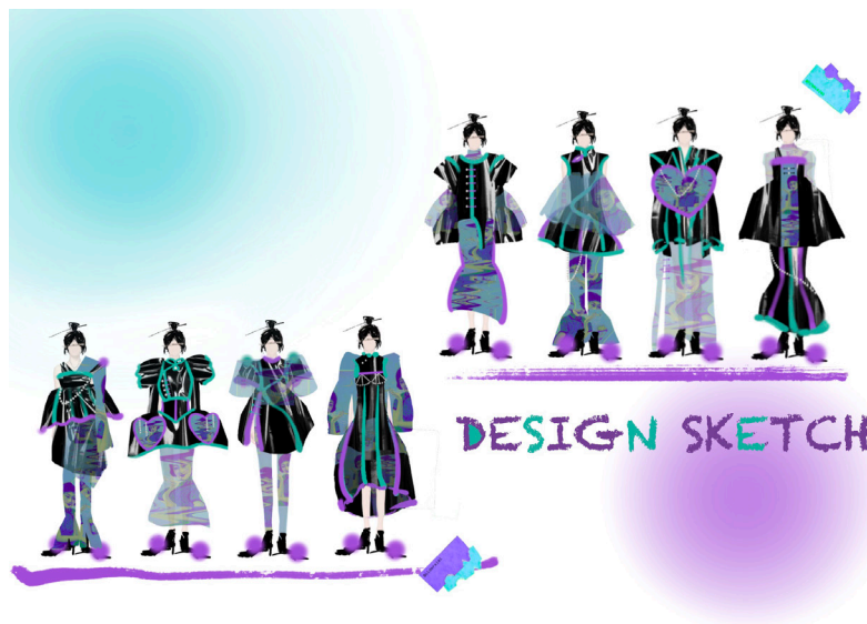
Figure 6. Design Rendering

The design adopts black high gloss patent leather, combined with Y2K love and classic elements of cheongsam, such as button up collar, tight waist, and slit hem. The lunar calendar pattern is spliced with patent leather, or combined with digital printed organza to create a hazy feeling. The rough edge accessories are interspersed with geometric lines, making them more eye-catching on black paint.