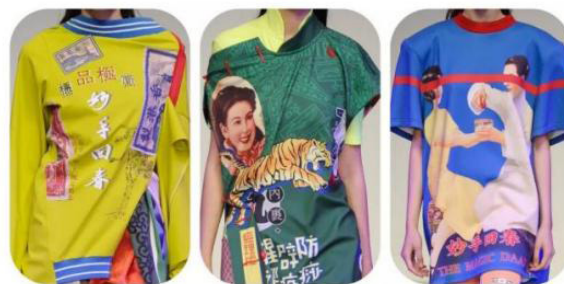
Figure 1. Mi Fan 2019 Spring/Summer Series

As an advertising artwork, The calendar card is often used in modern design for graphic and advertising purposes, and is also used by clothing brands as inspiration for pattern printing design. The designer brand Mi Fan in 2019 is themed around pills, using the female image of monthly signs and advertising fonts to reinterpret traditional culture through fun design.