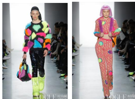
Figure 2. Jeremy Scott 2018 Autumn/Winter Collection

(2) The local resonance technique appears in clothing fabrics, stitching, and patterns. The Y2K style combines retro and futuristic elements, creating a diverse clothing design, showcasing layered clothing through element interaction.