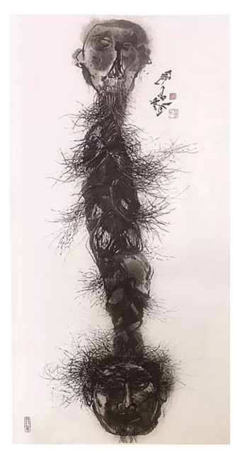
Figure 2. Series of Hair and Beard - 3 68cm × 136cm Paper Color 2001