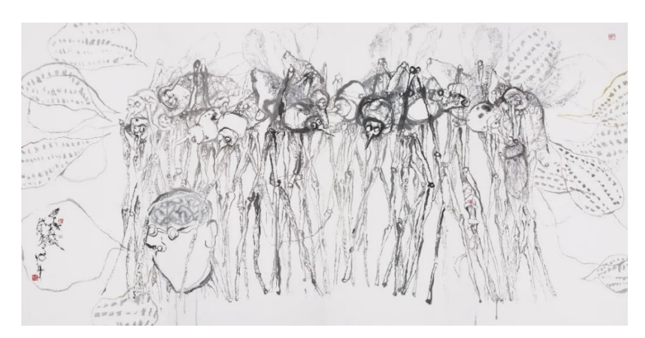
Figure 4. Series of Mosquitoes (1) 248cm × 248cm × 4 Paper Color 2020