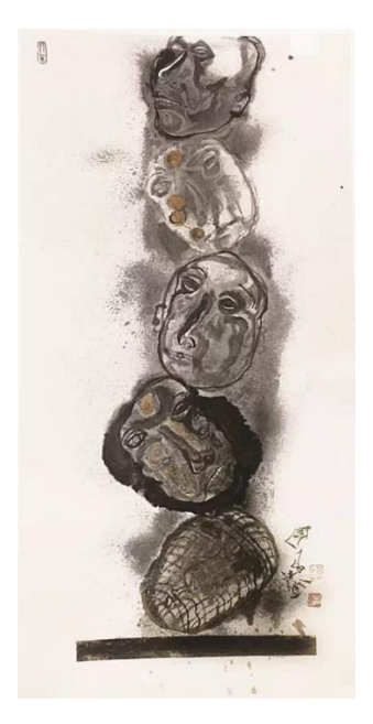
Figure 3. Series of Golden - 9 68cm × 136cm Paper Color 2008

The series of works "Watching Fishes" and "Fishing" are representations of the artist's own image, and the artistic expression gradually moves from the exploration of form to the depths of the heart, making Pu Guochang's paintings more natural, authentic, and free. In the "Cat" series of works, the image of cat is simplified and vivid, and the spiritual temperament of cat is vividly portrayed on paper. The artistic expression of artist are full of childlike charm, which is inseparable from the influence of his frank and pure personality, as well as the Guizhou's ancient folk culture. In the "Mosquitoes" series works, mosquito is a symbol that does not have the noble image in traditional literati paintings. Mosquitoes are commonly known as pests, however, Pu Guochang exaggerates and promotes them to enhance their vitality. They hover in mid air, overlooking all living beings, silent and lonely. They are vulnerable to the wind, but reveal a solitary and arrogant aura and intangible power. This is an external manifestation of the artist's spiritual world. In the loneliness of life, Pu Guochang became increasingly sensitive, gradually shifting from promoting the power of life to safeguarding his own spiritual home.