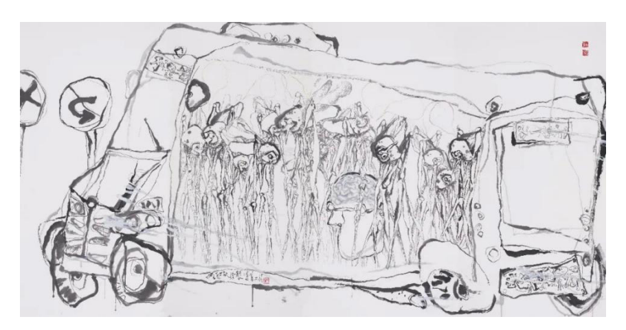
Figure 5. Series of Mosquitoes (2) 248 \text{cm} \times 248 \text{cm} \times 4 \text{ Paper Color } 2020