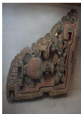
Figure 3. Huabogu

The composition art of ancient images on Dongyang flower boards embodies the unique aesthetic qualities of “variation within orderliness and order within flexibility”. By establishing a rigorous and orderly overall structure through balanced layout and a stable visual focus, and flexibly adjusting the arrangement of object combinations according to the specific shape and decorative requirements of the flower boards, as shown in Figure 3. This composition concept, which adapts to the shape and structure, fully reflects the profound understanding and innovative practice of traditional craftsmen in formal aesthetic laws. By the end of the Qing Dynasty, some flower boards blindly pursued exquisite craftsmanship, revealing the drawbacks of being flashy and cumbersome, disordered layers, dull composition, and artificiality. Although there were many fine works in the patterns of late Qing flower boards, the overall development was relatively sluggish.[4]