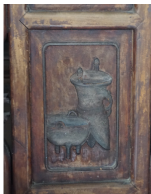
Figure 2. Ding Yi Bo Gu

The antique flower boards in Dongyang flower boards of the Qing Dynasty can be classified into five categories: bronze vessels, flowers and trees, bonsai, furnishings, and auspicious themes. The antique bronze vessels category centers around ancient bronze ritual vessels and is the earliest antique theme, inheriting the tradition of epigraphy from the Song Dynasty. The antique flowers category is related to the literati’s fashion of using ancient vessels to arrange flowers, marking a shift towards a more domestic aesthetic in antique imagery. The antique bonsai category uses the natural philosophy of mountains and waters in pots to express itself. The antique furnishings category simulates the scene of scholarly offerings in the study, constructing an ideal space for the study. The auspicious antique category employs homophones, symbolism, and other techniques to closely combine imagery symbols with folk wishes. The formation and evolution of these five themes constitute a typical paradigm of the localization and domestication of antique imagery.