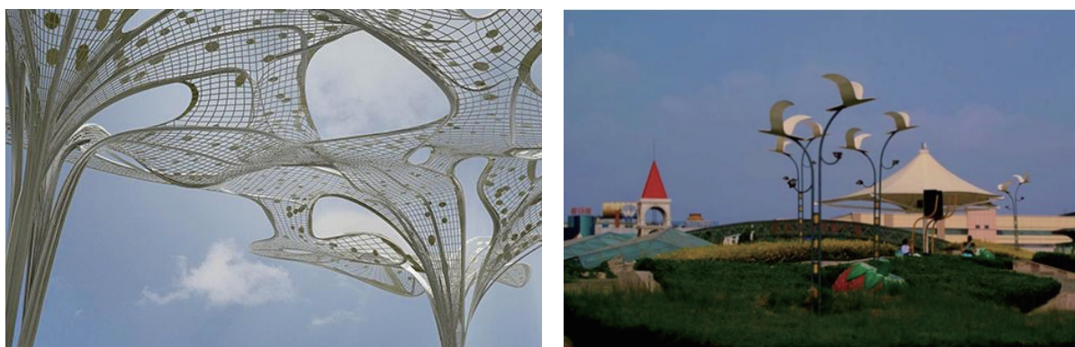
Figure 5. Public art in the city

Publicity is the common attribute of public art and urban art, which emphasizes that art is popular, social and environmental, rather than the product of individual artists. In artistic creation, we should not only meet people's material and spiritual needs, but also meet the public's aesthetic taste. What it emphasizes is the publicity of art, which reflects the humanistic feelings of the city, and spreads positive values through the combination of the two, thus showing the unique urban culture and spiritual outlook. When people walk in public space, they can enjoy works to the fullest, and they can also evaluate works, thus providing people with a more free, comfortable and humanized space environment and showing the cultural connotation of the city to the public.