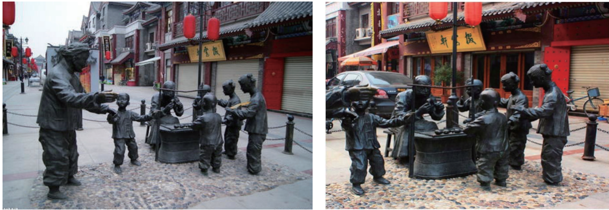
Figure 3. Sculpture of "Sugar Figure Blowing Art" in Tianjin Drum Tower

For example, the streets of Tianjin drum tower are a good example of the influence of urban art on public art. Designers can combine the scene of "Sugar Figure Blowing Art" with sculpture art, and show the long history and culture and unique city memory of Tianjin through sculpture, a public art. When people walk on the streets of Drum Tower, they will unconsciously be influenced and edified by urban art in public art, and feel the history and culture of Tianjin. Therefore, for any city, it is inseparable from its unique history and culture in the process of its development and growth, and public art will be influenced and infected by it to a certain extent, thus reflecting the local urban artistic characteristics. However, the symbiosis between public art and urban art at the historical and cultural level can be influenced by the historical and cultural details of the city. For some small cities or later developed cities, they are more susceptible to the influence of foreign cultural and artistic styles, which is of course related to the city's own history, culture and social development.