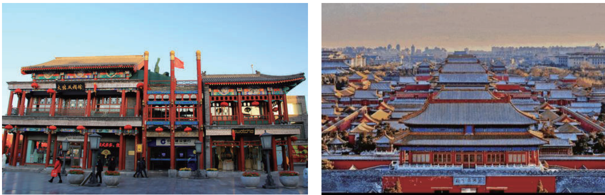
Figure 2. Ancient buildings in Beijing

Urban art is the accumulation and precipitation of a city's history and culture, the fixed impression and memory of a city, and represents the cultural tradition and living habits of the city [2] . Different from the publicity of public art, urban art is relatively restrained, implicit and more classic. It is an artistic feature formed in the long-term historical development and has a long history and cultural characteristics. For example, Beijing, the capital of China, has inherited the architectural features of different periods through the historical changes of several dynasties. Through these ancient buildings, we can see the cultural features of each dynasty, and these architectural styles are the best forms of urban art. Besides, we can also feel the social and cultural atmosphere behind these elements, such as architectural murals, colors, patterns, lines and so on. Although those are far away from us, we can still feel the time clues of the city, thus enhancing people's sense of cultural identity and belonging to the city.