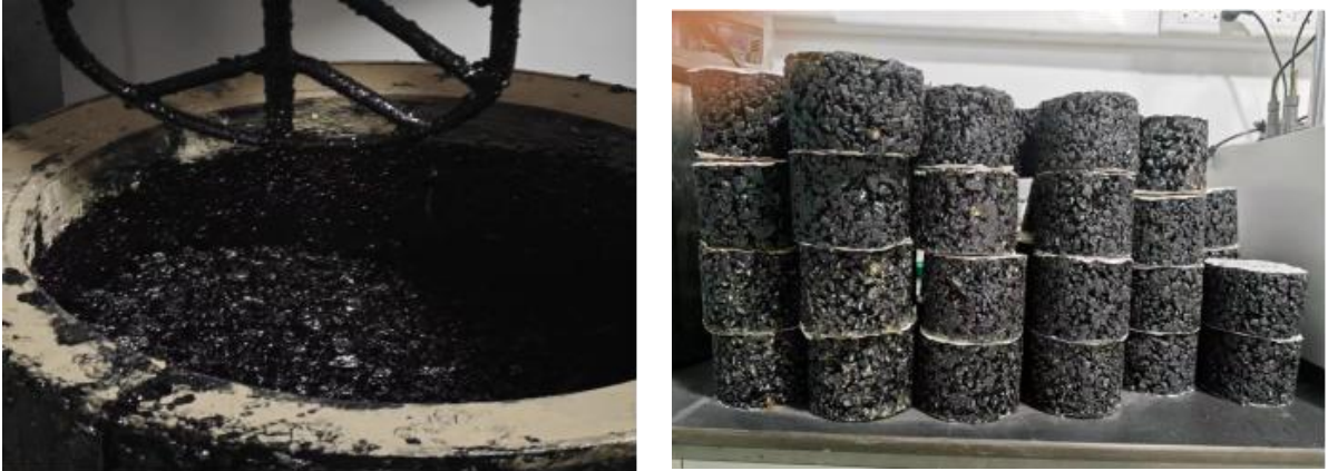
Figure 1. Asphalt mixture mixing and specimen formation

preparation, necessitating meticulous control over aggregate, asphalt, and ambient temperatures. Preceding asphalt mixture mixing, coarse and fine aggregates, asphalt, and mineral powder are meticulously weighed according to prescribed mix proportions. Subsequently, aggregates are heated to approximately 120°C, while asphalt is elevated to about 160°C. Sequentially, they are introduced into the mixing vessel for comprehensive blending, typically spanning around 30 minutes. Upon completion, the mixture is shaped into specimens for experimental evaluation (see Figure 1).