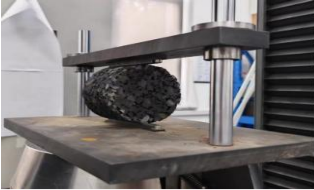
Figure 2. Compression diagram of indirect tensile strength specimens

preheating. During loading, each specimen is subjected to compression at loading rates of 2 mm, 5 mm, 10 mm, and 50 mm respectively. As the load increases continuously, cracks appear at the center of the specimen and gradually extend to both sides until the specimen fails (refer to Figure 2).