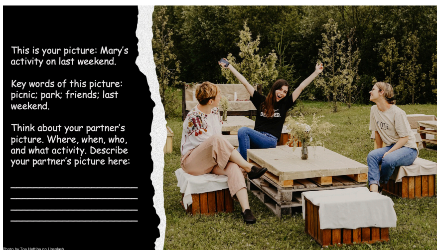
Figure 2. Handout for student B

1 Stage five: Ask students to list questions during their interaction and solve them.