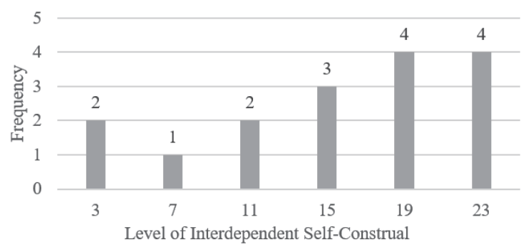
Figure 2. Distribution histogram of interdependent self-construal level for Chinese participants