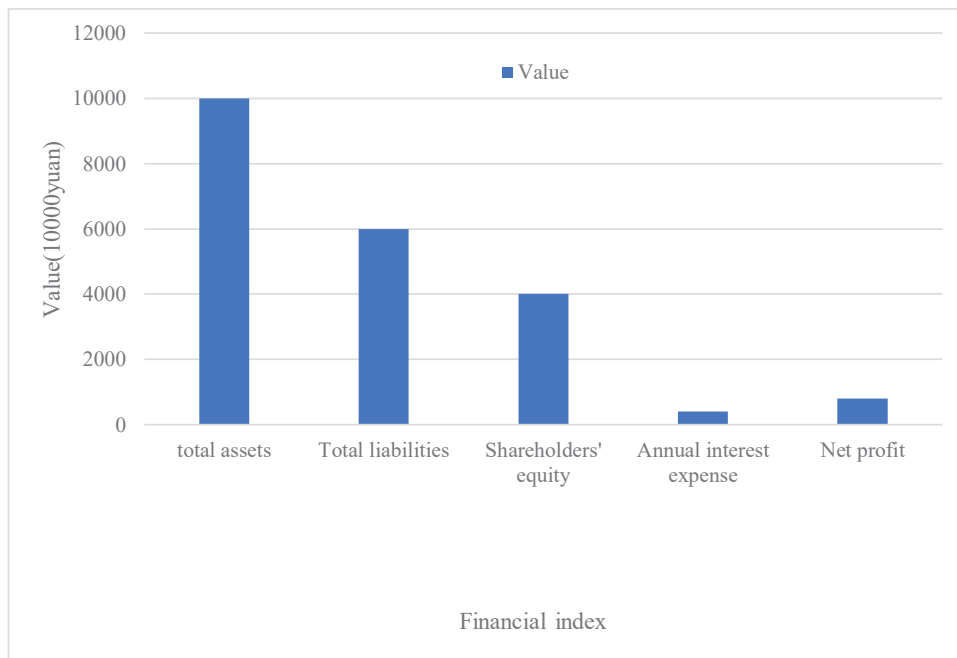
Figure 2. Values of different financial indicators