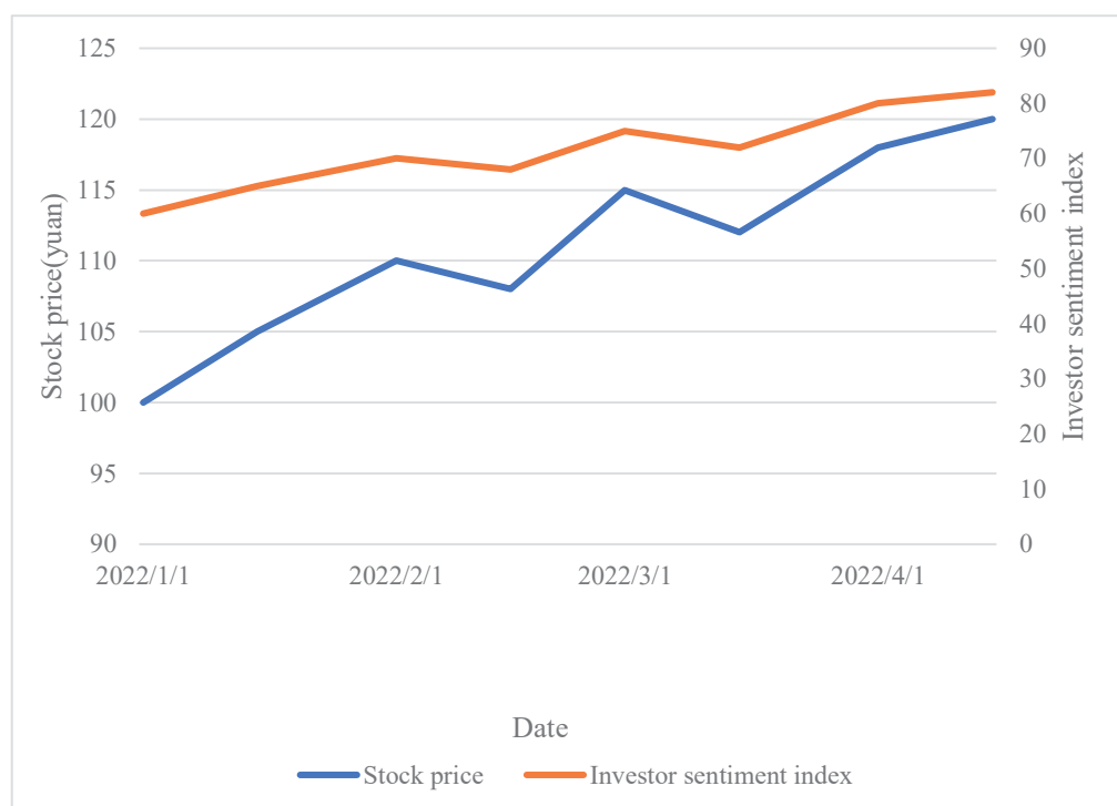
Figure 3. Stock prices, market indices, and investor sentiment indices for different dates

The market index and investor sentiment index for stock prices on different dates are shown in Figure 3. On January 1, 2022, the stock price was 100 yuan, and the investor sentiment index was 60.