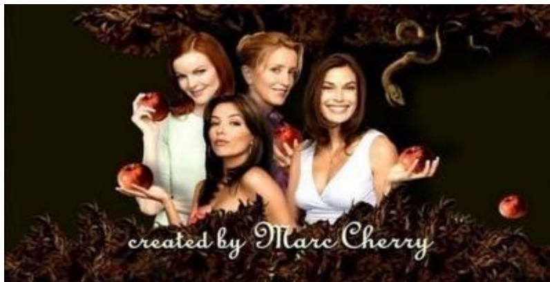
Fig. 6. Four housewives catching a "forbidden fruit"

The final scene shows each of the four housewives catching a "forbidden fruit" and smiling. Lynette holds an apple close to her chest, symbolizing her as the Mother Earth; Bree holds an apple in a savvy way, suggesting her meticulous homemaking; Gaby holds the apple in a seductive way, implying she embodies temptation; Susan holds the apple in a vulnerable position, representing the sorrowful and fragile woman [18].