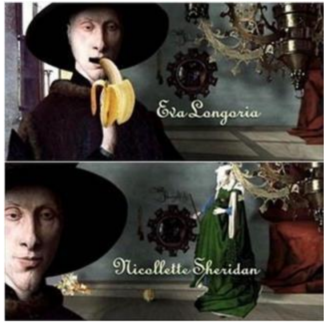
Fig. 4. The adding comedic elements to Portrait of Giovanni Arnolfini and His Wife (1434).