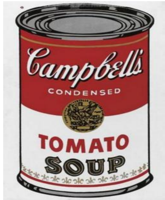
Fig. 4. Campbell's Soup Can (1962).