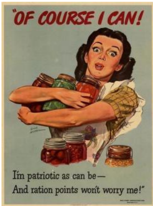
Fig. 3. Of course I can.

This is a famous poster from World War II. At the time, it undoubtedly promoted female empowerment and elevated women's status. Desperate Housewives carries on this spirit, but with a twist: the woman in the poster overlooks a very famous can - a can of Campbell's Soup.