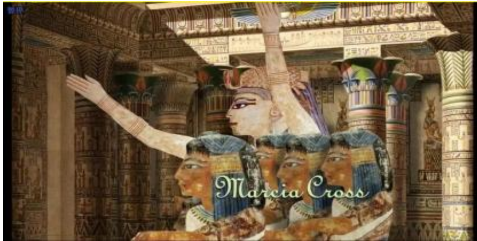
Fig. 2. Egyptian wall painting.

5.2 Analysis on the following series of scenes each describe the four women in the series