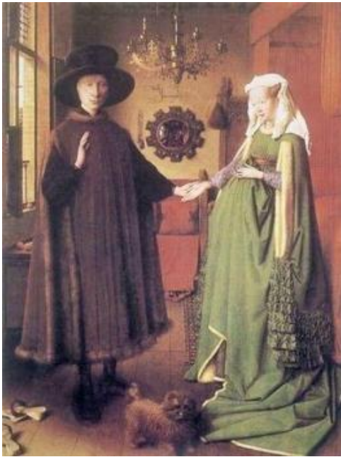
Fig. 3. Portrait of Giovanni Arnolfini and His Wife (1434).