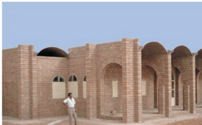
Figure 8. An institutional building made from compressed earth blocks in New Delhi, India

In general, soil cement can endure some shocks or strains brought on by seismic events. Tensile stresses that cannot be absorbed by the soil-cement material may develop in areas that are prone to very strong seismic disturbances; it is therefore desirable to provide vertical reinforcement to absorb stresses of this nature. At wall connections, enough vertical reinforcement is offered in accordance with IS: 4326. In seismic areas, it's crucial to construct walls with a continuous beam or band that adds rigidity and supports the stability of the home. According to IS 4326, a lintel band is also laid. Figure 8 shows an institutional building made from compressed earth blocks in New Delhi, India.