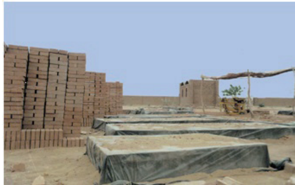
Figure 5. Stacking curing and protection of earth stabilized blocks

As soon as you can, place the blocks in a shady area with protection from the sun and rain on a level, absorbent surface. Place each block on its edge and leave enough room between them so that they do not touch. The blocks must be allowed to dry gradually without experiencing any abrupt temperature changes. Therefore, the first twenty-four hours after they are made require strict moisture control to prevent them from drying out completely all at once, this could degrade the material's quality. Blocks must be thoroughly sprayed three times per day with the fine water spray for 15 days after 24 hours of de-molding. Blocks must be properly sprayed three times per day with the fine water spray for 15 days after 24 hours of de-molding. The strength of the block will increase as it dries more slowly (Figure 5).