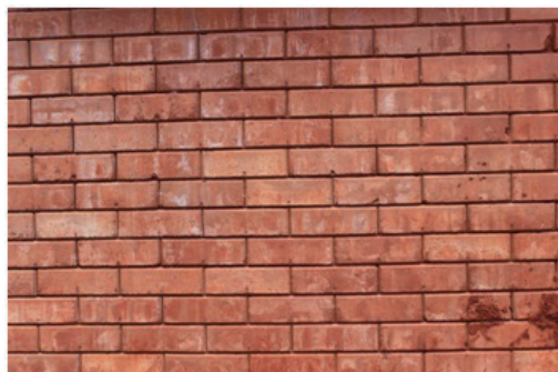
Figure 6. Masonry wall using compressed stabilized earth blocks

Bonding is the method used to arrange blocks in a wall. The careful arrangement of all the joints to ensure the proper transmission of vertical loads is a necessary condition for proper bonding. In other words, alternate courses are planned out in a way that prevents vertical seams or joints between one course and the one below from lining up (Figure 6).