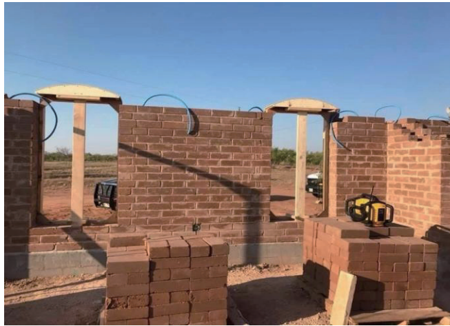
Figure 7. Construction of masonry wall using compressed stabilized earth blocks

The combined strength of the mortar and the blocks determines how strong a wall will be. It is possible to produce blocks with strength of 30 to 60 kg/cm 2 . In a wall subject to vertical pressures, blocks and mortar of similar strength will support the pressure in an equal manner; but, if there is any weakness in the mortar, the blocks will be susceptible to shearing stress, which invariably leads to cracks and fissures. Using low-strength blocks with high-quality mortars or high-strength blocks with weak mortars is a mistake since, in the latter case, the failure will be in the blocks rather than the mortar, in contrast to what happens in the former. In the construction of a soil-cement wall, water absorption by the blocks from the new mortar must be taken into consideration. It is advised to moisten the surface of the blocks in touch with the mortar to ensure there is enough water for the mortar to set properly (Figure 7).