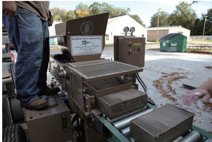
Figure 3. An automatic compressed earth blocks making machine

The process of manufacture of soil-cement blocks involves the following five steps (Adhlakha, 2019):