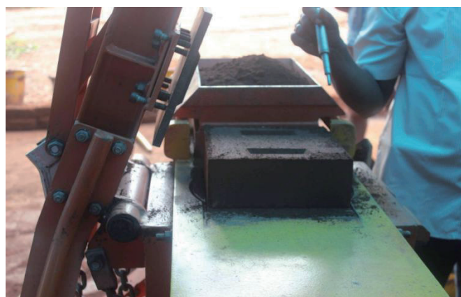
Figure 4. Compressing apparatus to create compressed stabilized earth blocks

The machine's mould is filled with the prepared mix, and pressure is then applied. The block is removed from the mould and stacked after being compacted. Care must be taken when handling and stacking the blocks because they are fragile when they are first formed. Figure 4 shows a manual compressing apparatus to create compressed stabilized earth blocks.