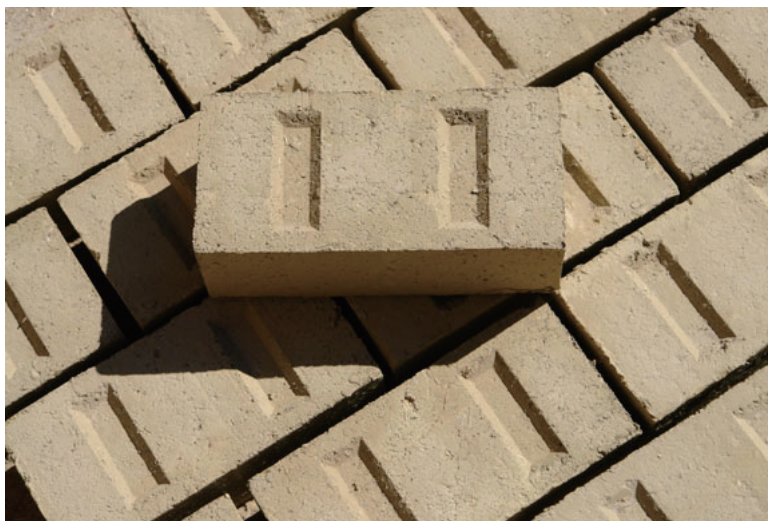
Figure 1. Compressed earth blocks

improvement. When the temperature needs to be changed, they do it with less energy. They may easily adapt to beautiful, intricate designs. With some restrictions, you can do whatever you want with the walls because they are load bearing (Powell, 2021). Figure 1 shows some compressed earth blocks left for sun drying.