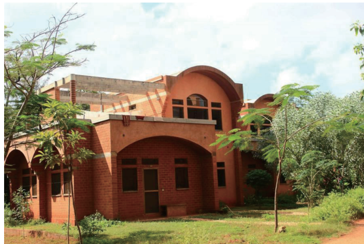
Figure 9. A residence made from compressed earth blocks, India.