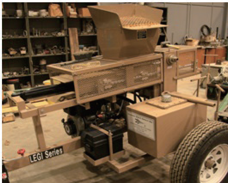
Figure 2. A semi-mechanized portable machine

The block is created by compressing the soil-cement combination in the press chamber. When a force is applied, the soil-cement mixture is compressed, which lowers the fraction of voids and raises the material's density. The higher the density may be increased, the less porous the soil will become. The amount of moisture must fall within a specified range and not be too high (Prasad, 2020).