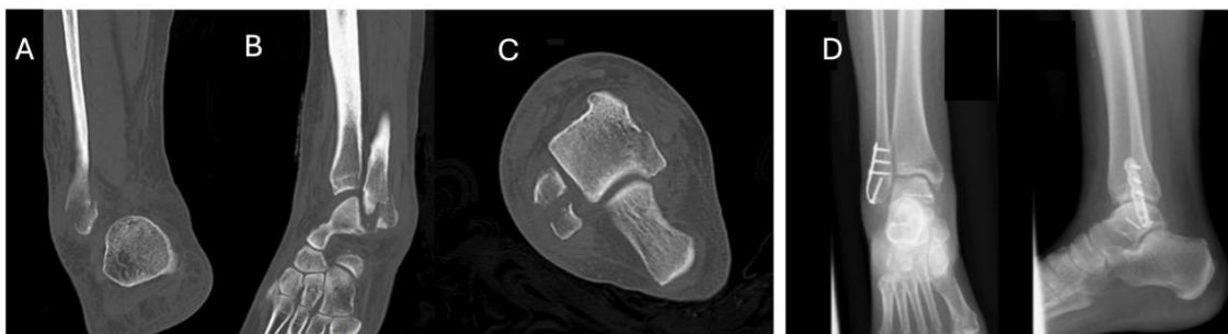
Figure 2. Example of SAD-1 infrasyndesmotc avulsion fracture treated by hooked plate. (A-C) Preoperative CT scan: distal fibula avulsion fracture. (D) Postoperative X-ray showing hooked plate with compression lag screw.

compression plates and/or screws, or anatomical reconstruction plasties in cases of chronic instability [18, 23] (Fig. 2).