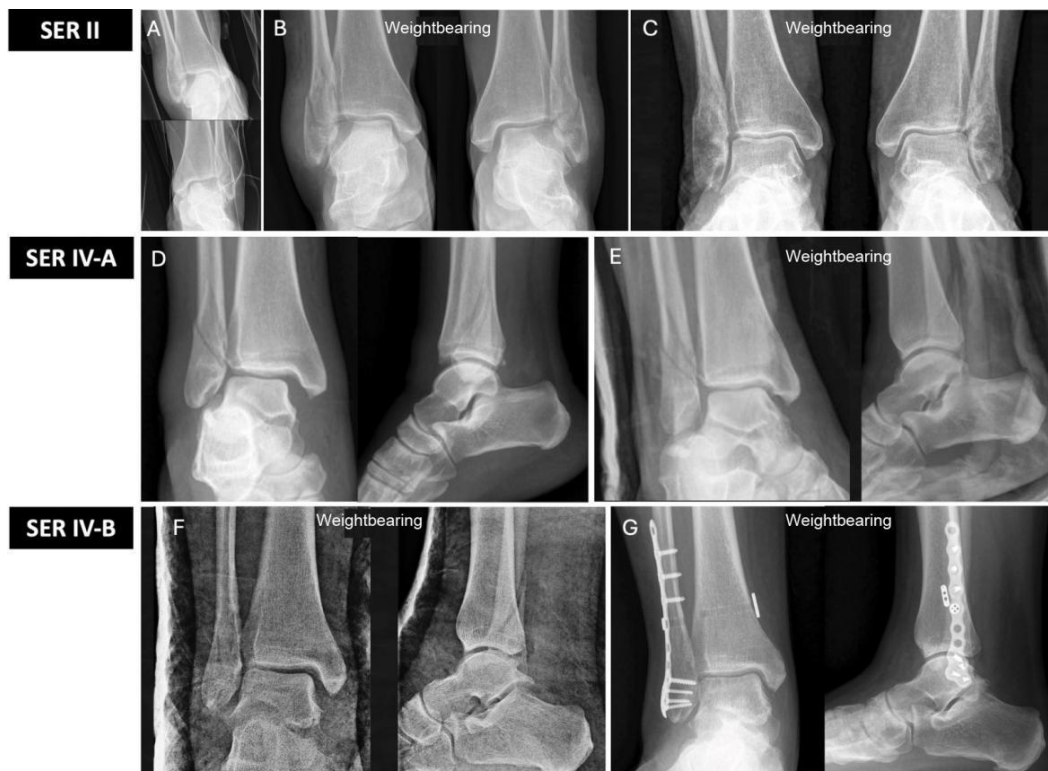
Figure 4. Example of SER 2 fracture. (A) Non-weightbearing X-ray showing bilateral trans-syndesmotic fibular fracture. (B) Weightbearing X-ray MCS maintained (<4 mm). It was treated by immediate weightbearing without immobilisation. (C) Weightbearing X-ray at 6 months showing correct fracture healing. Example of a SER 4a fracture. (D) Non-weightbearing X-ray with increased MCS (>4 mm). (E) Weightbearing X-ray showing reduction of the medial clear space with loading at 90°. The fracture was managed conservatively with a weightbearing cast. Example of SER 4b ankle fracture. (F) Weightbearing X-ray showing opening of the MCS and asymmetry of the mortise (unstable lesion). (G) Surgery is indicated with open reduction and internal fixation with plate and screws in the fibula and fixation of the syndesmosis by means of a dynamic system.

SER 4 fractures with medial bone injury (bimalleolar or trimalleolar) are considered unstable injuries and surgical treatment is recommended. However, in the case of SER 4 fractures with medial ligamentous injury, we divide them, depending on whether or not the posterior fascicle of the deep deltoid ligament (dPTTL) is injured, into stable (SER 4a) and unstable (SER 4b). [4, 5] SER 4a fractures can be treated conservatively, using a 90° weight-bearing cast [4, 38] (Fig. 4). It is important to note that this weightbearing cast should not be removed or replaced by a removable boot, as dorsal flexion at 90° helps the anterior fascicle of the deep deltoid ligament to heal in an appropriate position. If a removable boot were used, this ligament could heal in an incorrect position, which could lead to ligamentous laxity and instability of the ankle in plantar flexion. Thus, SER 4a fractures are potentially unstable if treated incorrectly. However, SER 4b fractures are considered unstable from the outset and require surgical treatment of the fibula and deltoid ligament (Fig. 4). This is because the posterior fascicle of the deep deltoid ligament cannot heal on its own and needs repair. [36]