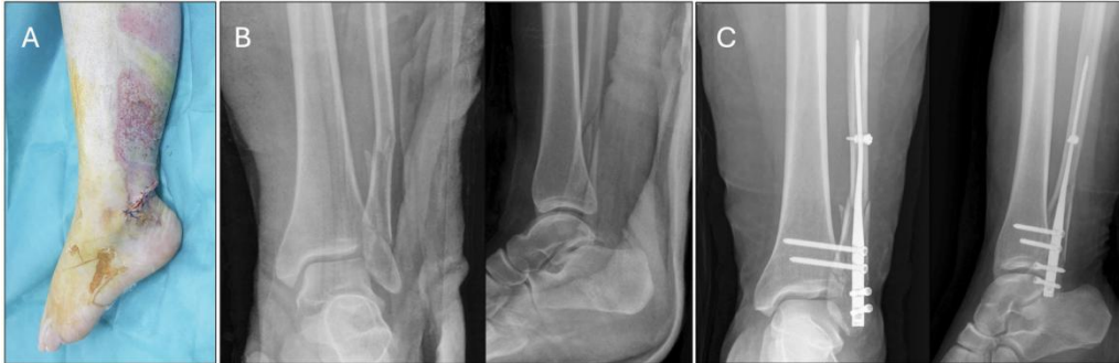
Figure 6. Example of a fibular fracture treated with a second-generation intramedullary nail due to soft tissue involvement. (A) Clinical image showing severe soft tissue injury (open fracture wound). (B) Preoperative X-rays showing bifocal fibula fracture. (C) Postoperative X-rays showing second generation nail fixation and trans-syndesmotic fixation with 2 screws through the nail.

Early nail designs had complications such as implant migration and shortening of the fibula, and not allowing proximal fixation. However, the new nails allow proximal and distal locking, and indications can even extend to comminuted fractures, maintaining the length of the fibula. [65, 66] These new nails also allow stabilization of associated lesions of the syndesmosis, with the possibility of placing screws or dynamic systems through the nail [64, 65] (Fig. 6).