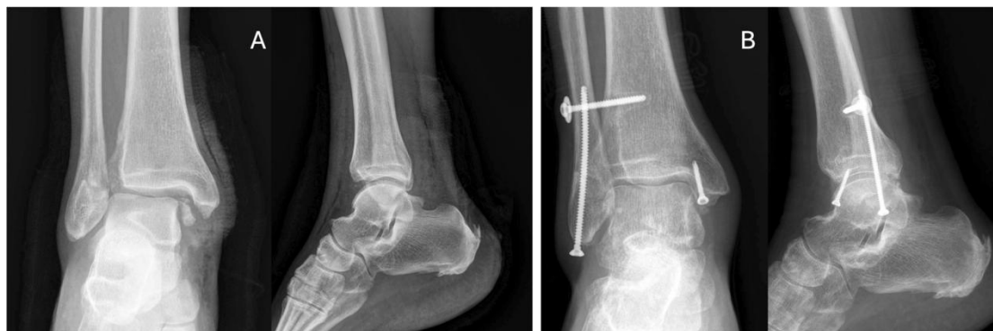
Figure 5. (A and B) Example of a trans-syndesmotic fibular fracture treated with 3.5 mm intramedullary screw and screw fixing the syndesmosis.

Screws with a diameter of 3.5, 4.2, or 4.5 mm are the most commonly used for this intramedullary technique. [60] Reduction techniques can be performed with percutaneous forceps under fluoroscopic control, prior to screw insertion. Ideally, 3.5 mm long cortical screws are preferred, as they have great flexibility and ability to adapt to the medullary canal. [61] The 3.5 mm screw also allows sufficient space to combine fixation with a percutaneous trans-syndesmotic screw [60] (Fig. 5).