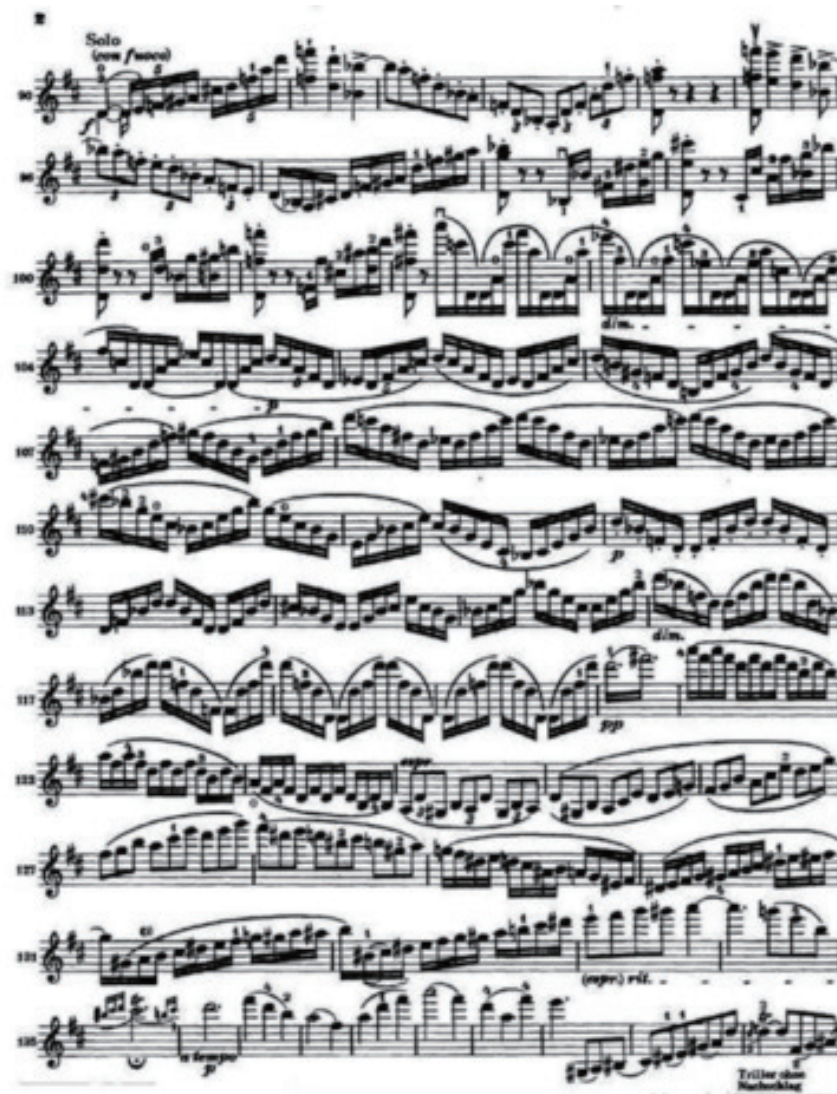
Figure 1. The first part

Brahms's Violin Concerto in D Major is divided into three movements. The first part, the mediocre allegro, with a stormy beginning, has the momentum of Beethoven's works.