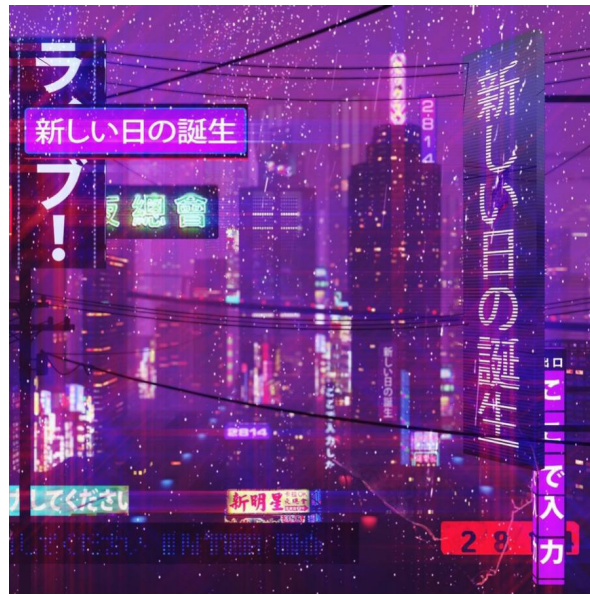
Figure 1. 2 8 1 4, 新しい日の誕生, released in 2015