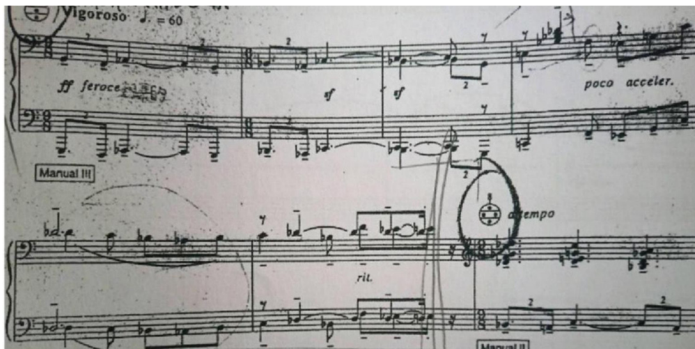
Figure 1. Phrase a

The first movement, the powerful Moderato, exposition, differs from the classical sonata in that the exposition is not in the pattern of first tonal area and second tonal area, but in the first tonal area, second tonal area 1, second tonal area 2. The first theme appears in the first tonal area, phrase a (see Figure 1. phrase a).