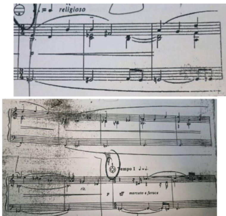
Figure 3. Phrase c