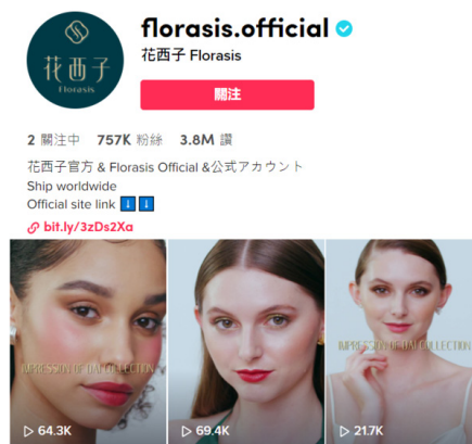
Figure 2. 2021 Florasis North American Double Eleven Makeup Artist Collaboration Project