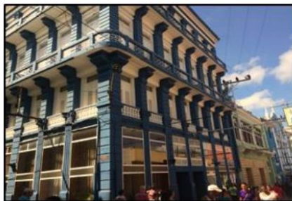
Figures 2. Iberostar San Félix City Hotel, 4-star hotel (construct area 666 m 2 ).

Based on the above premise, this chapter aims to reveal a guide as the basis for evaluating the energy efficiency of urban hotels based on architectural design factors. The application results of the guide in Iberostar San Félix City Hotel, Santiago, Cuba (Figure 2 and Figure 3) are also shown in summary form. The analyzed aspects are integrated in the table, making the interpretation of these aspects more simple.