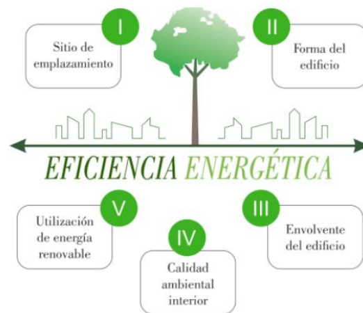
Figure 1. Architectural design parameters for energy efficiency in city hotels.

Based on the analysis of the sustainable assessment methods of international energy categories and the Cuban Standard 220-1: 2009 in the above assessment guidelines, the architectural design requirements and parameters for the energy efficiency assessment of urban hotels are determined (Figure 1).