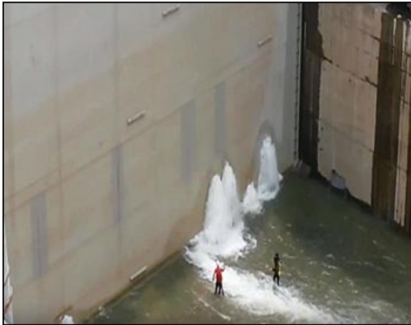
Figure 4. Dam design failure.