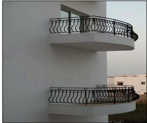
Figure 3. Technical error on the balcony.