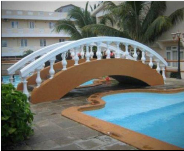
Figure 2. Technical error on the bridge.