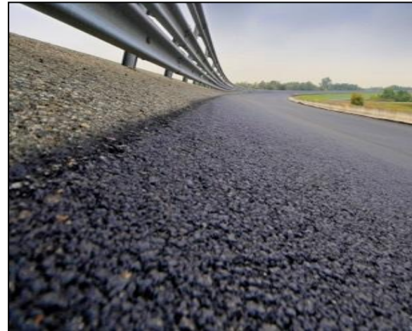
Figure 5. Isolation of defective materials.

In all cases, in order to successfully construct or execute the project with appropriate quality, special attention needs to be paid to "integrating" all necessary actions to make the final result (constructive project) conform to its design purpose, in a timely manner and at an appropriate expected cost.