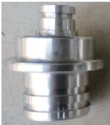
Figure 2. Physical drawing of the machined transmission shaft - external features

After the parts drawings analysis, process schemes formulation and CNC programming are completed, the blank of the transmission shaft is installed on the three-jaw chuck of the CNC lathe. The transmission shaft is processed by the CNC lathe. When operating CNC machine tools, pay attention to operations such as tool setting and program transmission, and the tool setting results should be verified before further processing. The cutting parameters should be optimized and adjusted in time according to the on-site machining conditions to obtain the best processing parameters, so as to process good quality parts. The actual processed transmission shaft is shown in Figures 2 and 3.