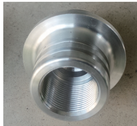
Figure 3. Physical drawing of the machined transmission shaft - internal features