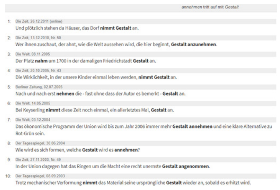
Figure 2. Example sentences with annehmen and Gestalt

In summary, akzeptieren intends to be used with negative words rather than Annehmen. Annehmen is often affirmative, meaning to accept. Users can also click on a word to view example sentences (see Figure 2) in the process of comparison. The example sentences are provided by a large corpus. There are many types of corpora in the electronic dictionary of DWDS corpus, such as: DWDS-Kernkorpus 21 (2000-2010), Historische Korpora (1465-1969), Berliner Zeitung (1994-2005), Die Zeit (1946-2018), etc.